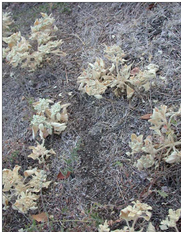
Fig. 1: Trunk trail (runs vertically through photograph) cleared by a Nearctic Messor , M. andrei , California, USA.

Group recruitment is when a leader ant uses motor displays to induce 5 - 30 workers to follow a short-lived odor trail, such as occurs in several Camponotus species (HÖLLDOBLER 1971a), Aphaenogaster cockerelli , A. albisetosus (HÖLLDOBLER & al. 1978), A. senilis (CERDÁ & al. 2009),