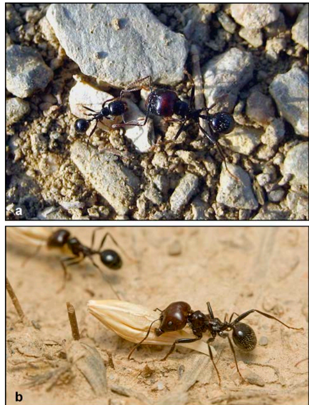
Fig. 2: Old World Messor : a) A major worker of M. barbarus carries a seed of Planatus hybrida in Sevilla, Spain. b) A laden M. structor forager.

Messor barbarus is the best studied group foraging species. It is a polymorphic species that has temporary and permanent components to its trails (PICKLES 1944) (Fig. 2a). The description of permanent foraging trails having "vegetation and other obstacles found by workers... cleared" (DETRAIN & al. 2000) fits our definition of trunk trails. Trail length ranges from 1 - 30 m (REYES 1986, CERDAN 1989, DETRAIN & al. 2000). Claire Detrain (pers. comm.) describes trails as about 10 - 20 cm wide, and they are often branched (LÓPEZ & al. 1993a, 1993b, 1994). More branching and shorter links develop after a productive season, whereas an unproductive season results in longer links and fewer branches (LÓPEZ & al. 1994). This change in topology adjusts the search area to the resource level.