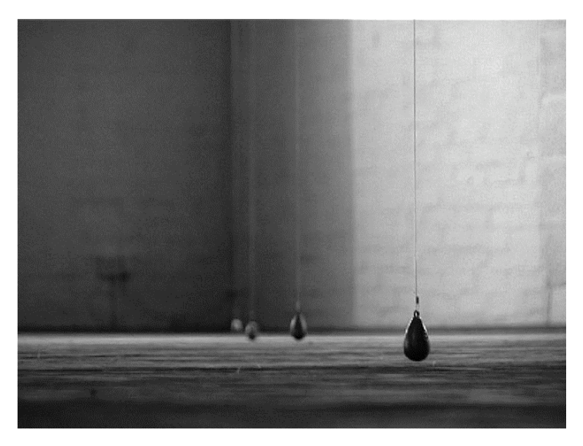
Figure 5. Say: "parsley,".

I cannot account for lines that I missed entirely in my notes, nor for all of the other more minor listening discrepancies although sense is ruptured through each, but these occurrences serve to highlight how partial my perception, and possibly of all other temporary operators of this "text", remains. Whether I heard them but omitted to write them down or whether I was repeatedly distracted or they were for some reason less audible in either recording or playback I cannot accurately testify. Bergvall might have made an impromptu edit into her own text during recording. Whatever happened I am left feeling like a temporary witness--participant to a truth, to which I alone can never provide an adequate response. The site has become the text and vice versa to such an extent that I cannot answer the question, what is not part of the text?