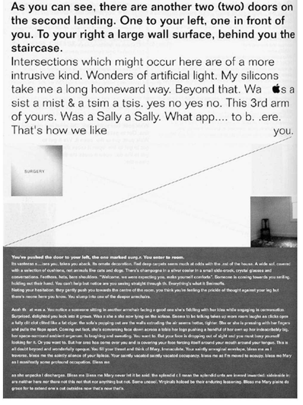
Figure 2. Caroline Bergvall, "éclat sites 1-10" in Performance Research Journal (1996),

modification; Sally being a partial modification of Dolly (the cloned sheep). The body of the house and the body of writing being cast together into positive and negative spaces as a sequence of implicative chambers. Multiple textual differences exist between the book Éclat (literally translated from the French as "fireworks" or a "showpiece") and journal éclat sites 1-10 versions of some of these variations sizeable; often necessitated in response to exigencies of format and context, once again seeking a dynamic imperfect fit with site in the sense that both book and journal can be understood to be sites.