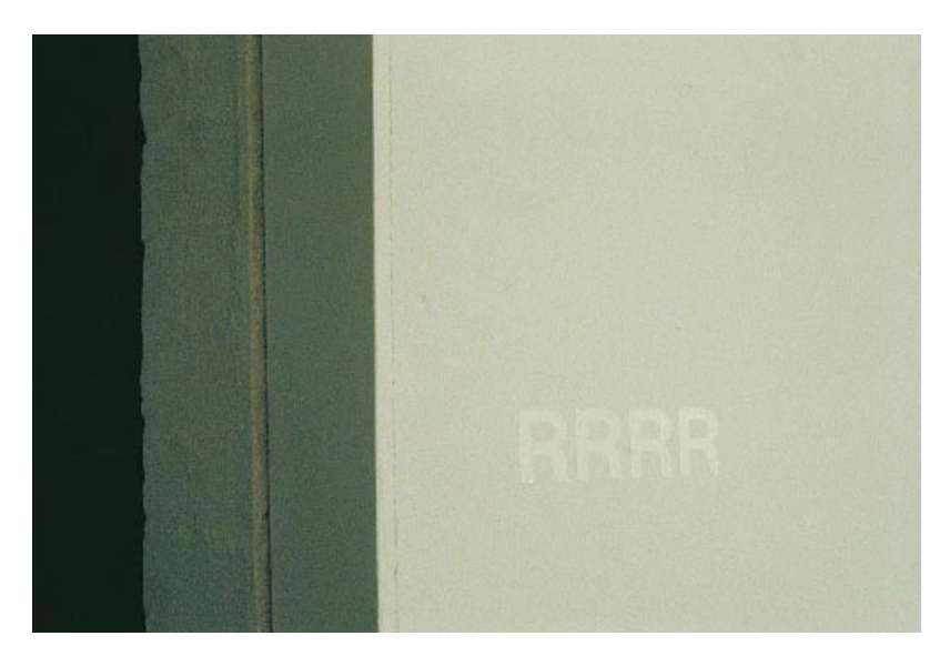
Figure 3. Say: "parsley," photo, Gary Winters (2002).

Leaving the entrance, an echoing foyer, turning up the volume on my attention and awareness so as to experience this forthcoming writing as fully as I am able, I entered the darker body of the Spacex 2 building's interior through a dividing curtain. In doing so I have already missed a prefatory textual detail, four stencilled white "R"s stuck onto the white wall beside the gallery entrance; as if there were a fourth R in the National Curriculum alongside reading, writing and arithmetic, possibly regulation, rule or even right (Figure 3).