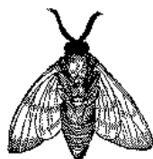
Figure 2: A sample black and white graphic (.eps format) that has been resized with the epsfig command.

Theorem 1. Let f be continuous on [a, b] . If G is an an-