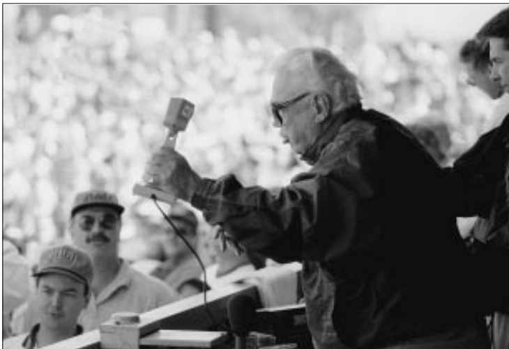
Harry Caray leads fans in his favorite song, "Take me out to the ball game," during a spring training game at HoHoKam Park in Mesa. Caray has spent more than 50 years as a sportscaster.