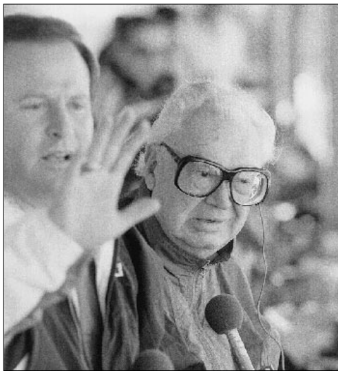
Harry Caray smiles at his fans after a Cubs baseball game. His co-host, Steve Stone is next to him, waving to the crowd.

teman returned. He easily snuck past the security guard, who's sitting on a step a few feet below, more interested in the game than his job. The man was in prime position for an autograph, waiting for the chance to talk to Caray, but the guard suddenly returned and ushered him away.