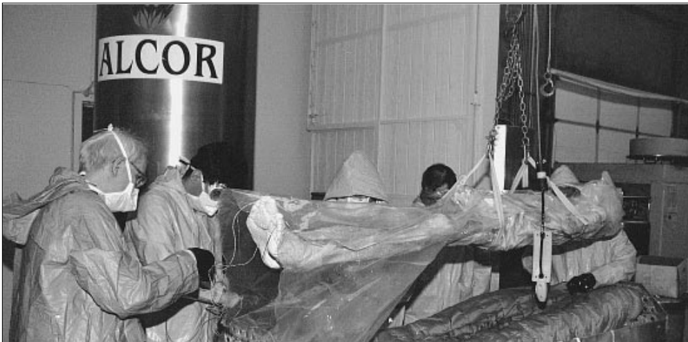
Workers at Alcor suspend the body of Michael, who suffered from AIDS and died of pneumonia. Next stop for the body, which had to be handled extremely carefully because of the infectious diseases, will be a silver metal thermos. It will be kept there until there's a cure found for deadly diseases.