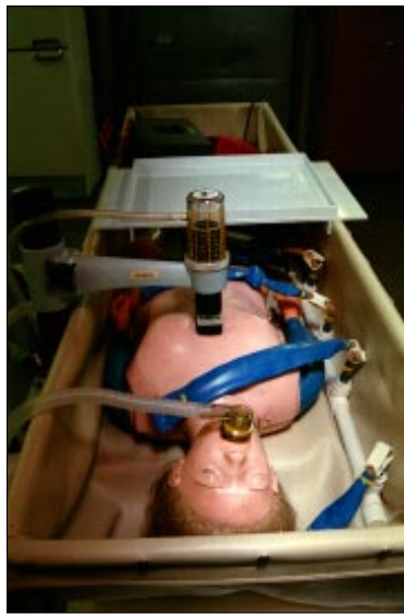
A dummy lies in an ice chest at Alcor in Scottsdale, waiting for the next time workers use it in the suspension process.

"The mortician's services cost about $1,000 and the surgeon about $2,500," Bridge said. "Then there is the trans-