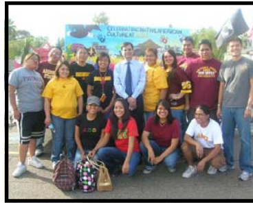
NARD 2007 ASU Student Float

and Community Resources — If it's important to you to remain connected to Tribal communities make sure get to know your Tribal representatives and support services, this is critical to establish a good foundation to help you through your college years.