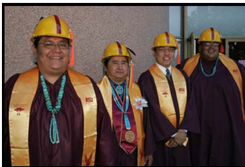
Del E. Webb School of Construction Graduates

Fall American Indian Convocation took place Thursday, December 13, 2007 at 4 PM, in Neeb Hall, Tempe Campus. Numbering at 93, this is the largest fall graduating class to date; 2 Doctoral Degrees, 8 Masters