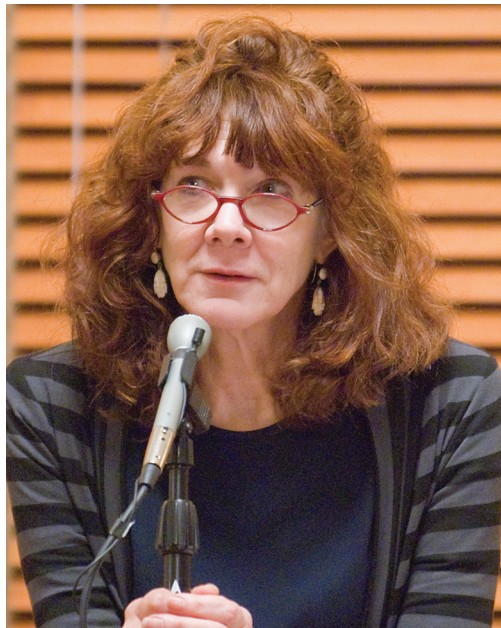
Poet Mary Ruefle during the 2009 Desert Nights, Rising Stars Writers Conference.