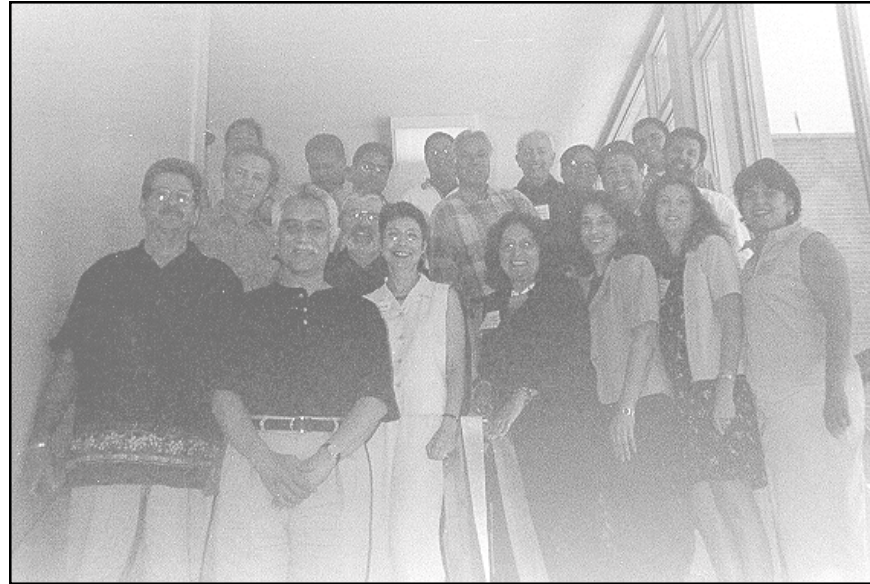
Attendees of the HBLI scholar's meeting, including scholars and HBLI fellows from UCR and ASU (see our full list of HBLI scholars on the back page).

Fewer Latinos gain access to higher education than any other ethnic group. Without at least four Advanced Placement classes and strong standardized test scores, they will not be able to get into a four-year institution. Fifty-three