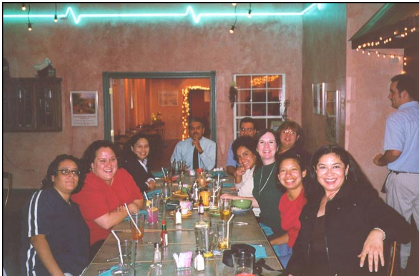
ASU and NMSU fellows and HBLI staff enjoy an informal evening in Las Cruces.