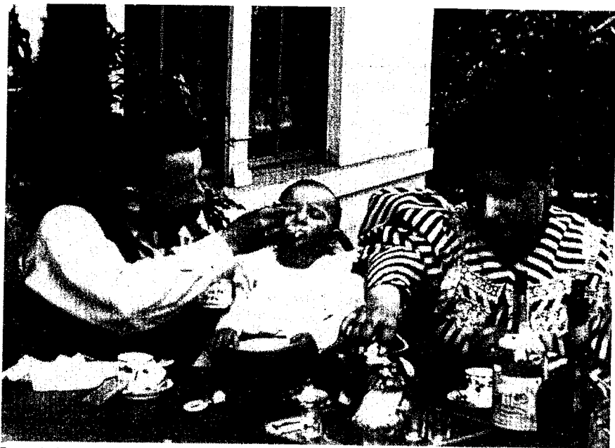
Lunch for Baby