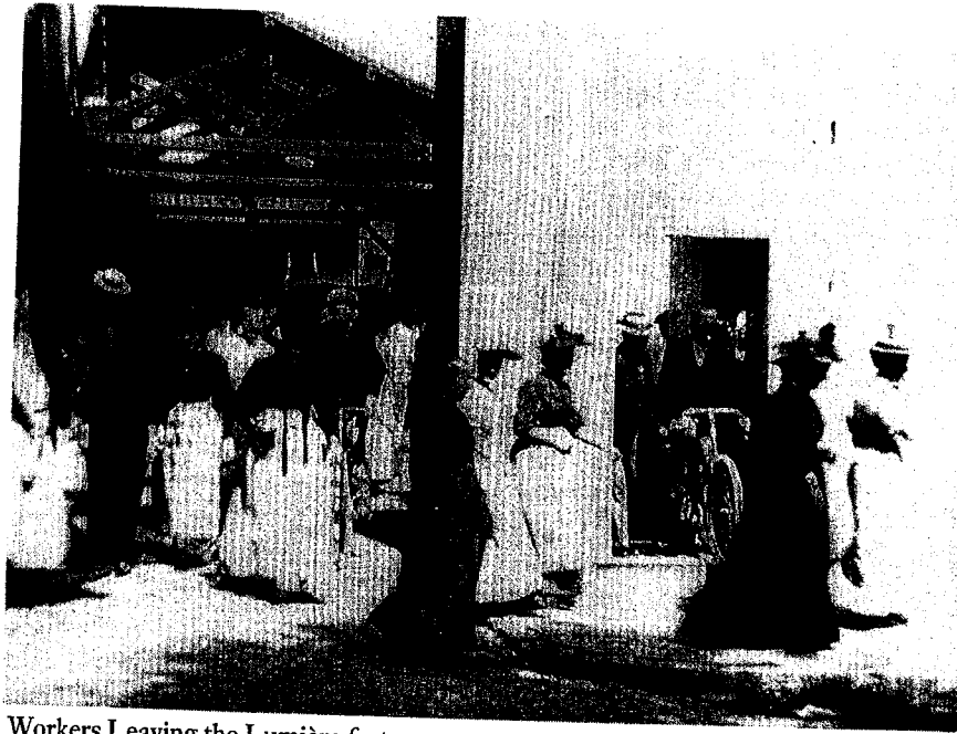
Workers Leaving the Lumière factory