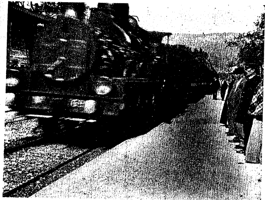
Arrival of a Train in the Station at La Ciotat