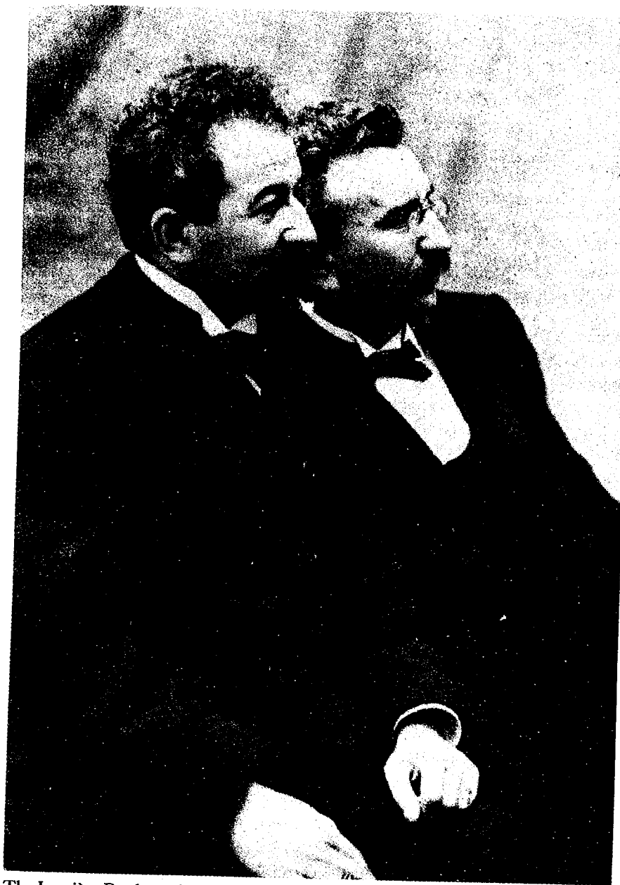
The Lumière Brothers: Auguste and Louis