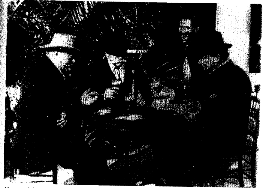
Game of Cards