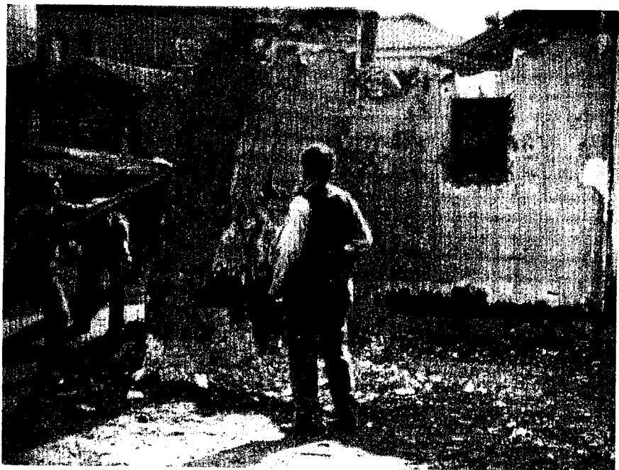
Demolishing a Wall