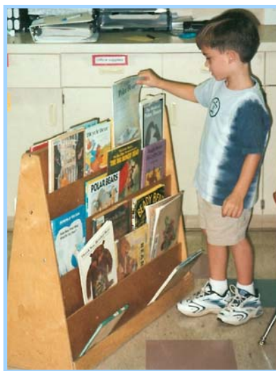
College of Liberal Arts and Sciences Department of Speech & Hearing Science

The Infant Child Research Programs , offered through the ASU Department of Speech and Hearing Science, serve as an interdisciplinary research, training, and service delivery facility that is funded by Arizona State University and various Federal Research and Training Grants. In addition to providing cutting edge education and therapeutic programs for families and their young children, the ICRP trains future practitioners and researchers and includes an ongoing program of research in early intervention, early literacy, and the use of assistive technology to enhance developmental outcomes. The goal of the research program is to develop, test, and identify supports and services for families and their infants and young children including those with disabilities and those who are at-risk.